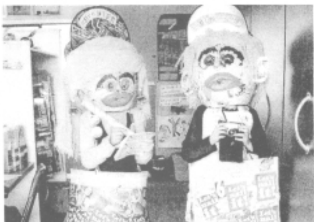
"The Junior Cadets" as created by the children of Room 4 at Omata School.