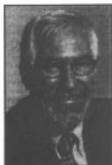
Hon. Harry Duynhoven MP for NEW PLYMOUTH