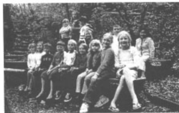
Children of Omata School in their wonderful 'bush classroom'.

***** Subscriptions are now available to The Oakura Messenger for those who live out of the area but want to enjoy the local news. $15 per year will ensure you get one sent to you each month.