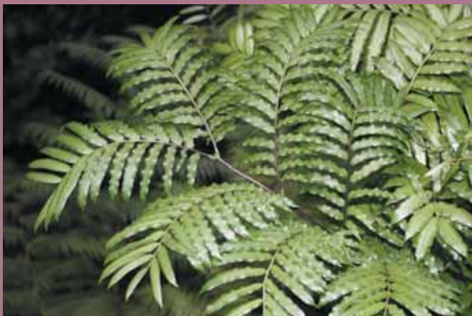
King Fern. The Security Essence. Helps clear the energetic imprint of painful physical experiences and life endangering situations.

The First Light flower essences are great for providing support during times of transition and change such as moving house, starting a new job, starting school, marriage, becoming a parent, divorce/separation, children leaving home, retirement or the loss of a loved one. First Light also have a great range of 17 Life Management flower essence combinations that can be dispensed without a consultation including Sleep Support, De-stress Support, Confidence Support, Weight Loss Support, Exam & Study Support and Crisis Support (New Zealand equivalent of Rescue Remedy.)