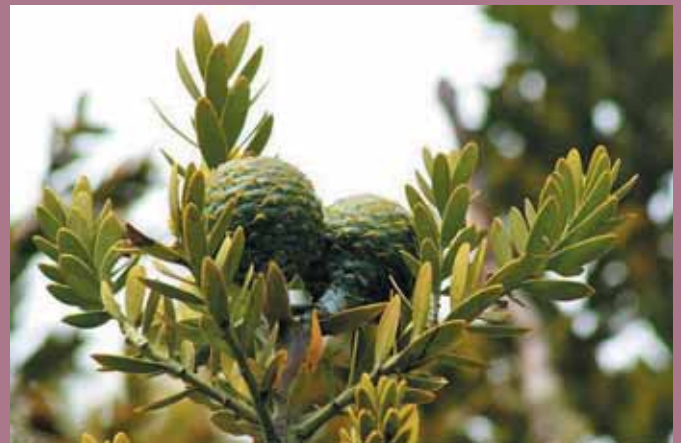
Kauri. The Beauty Essence. Helps with anxiety around love and promotes self acceptance.