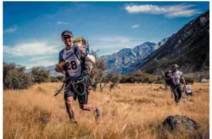
The GODzone Adventure race venue, photos from GODzone