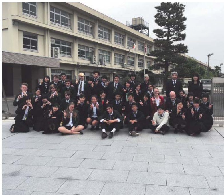
Japanese tour students with their billets and Principal of Hatsukaichi High School.