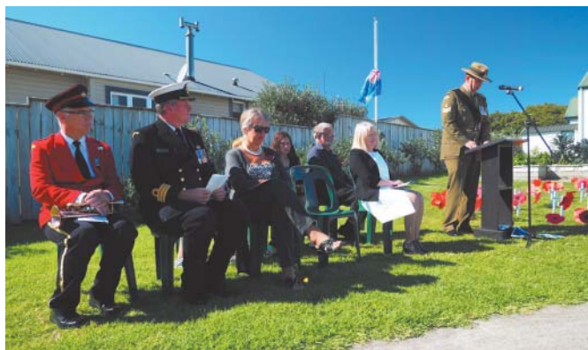
ANZAC Commemoration Day.