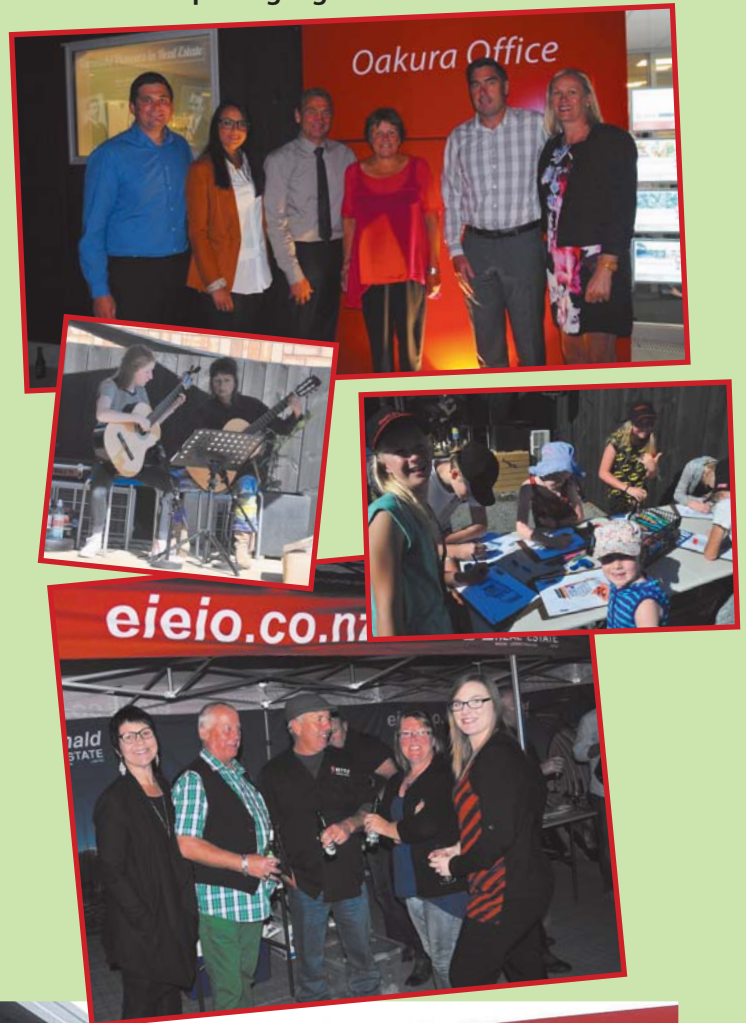
Opening night celebrations.