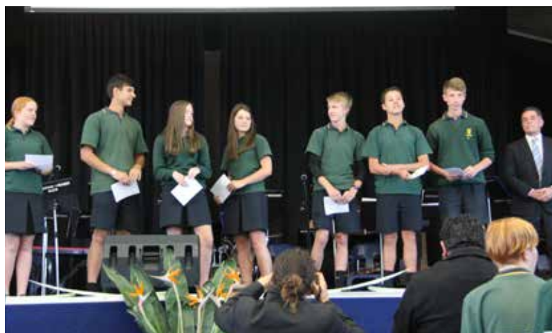
Year 9 and 10 top scholar recipients