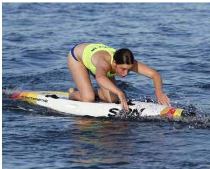
photo above of the smallest juniors making good use of the river on our first junior surf Sunday for the season