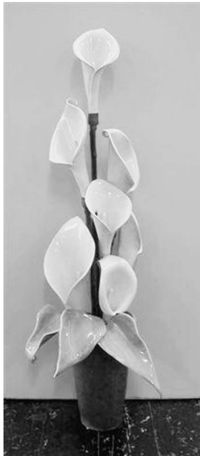
Winning exhibit, Arum lilies by Cecily Bull.

The club continues to be active with monthly activities to inspire members. The evening activity for April will see members learn more about making porcelain pinch pots. Porcelain is a particularly fine clay body, often used for delicate pieces, firing at around 1300° C.