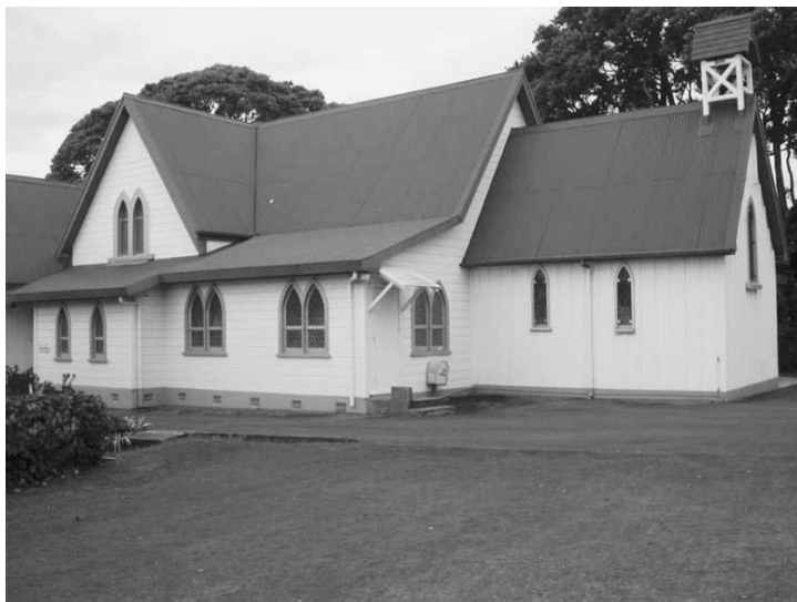
The church today.

The celebrations will end in the evening with a dinner planned for the entire congregation.