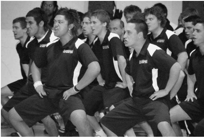
A haka to welcome the Aussie players to New Plymouth.