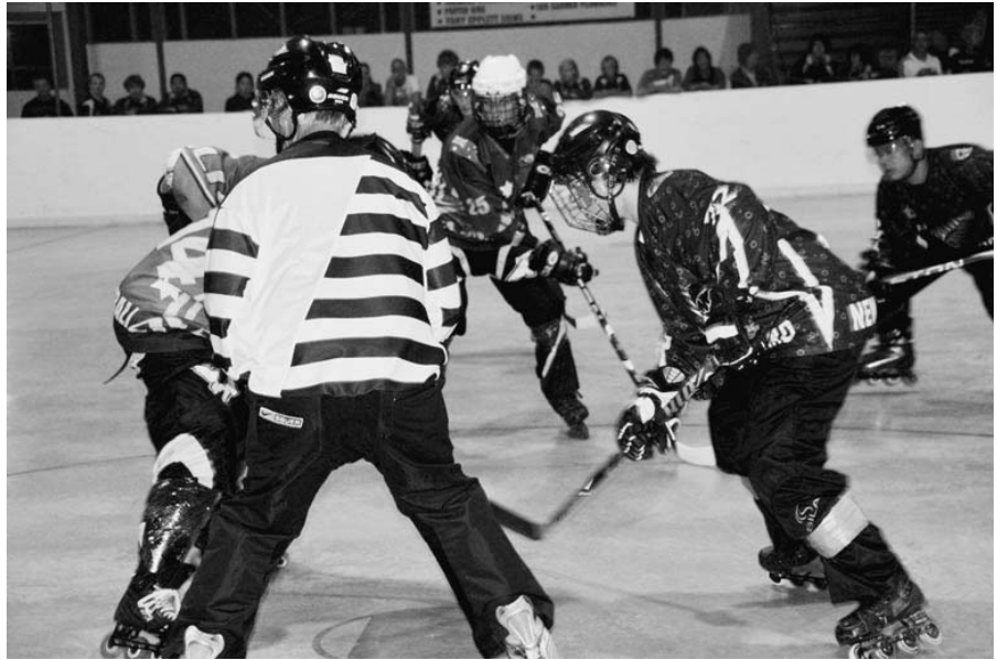
Above: a premier game in action

The influx of our "Aussie" neighbours recently with their distinctive yellow and green uniforms was not due to a sudden migration across the Tasman - it was due to a "trans-Tasman" clash in its 14th year, between New Zealand and Australian representative teams who play inline hockey, with New Zealand keen to take back the trophy they "misaid" in Perth in 2009. The event is the Oceania Asia Pacific Inline Hockey Championships. The event attracts over 250 athletes from 14 years through to senior men, women and more recently the added grades in masters and veterans divisions. A total of nine divisions competed over a five day period at the New Plymouth Rollersports