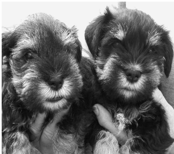
Two very cute miniature schnauzer puppies.

The two pictured pups are still for sale whilst their brother and sister Benny and Daisy have new homes waiting for them in Auckland and Whangamomona when they are eight weeks old.