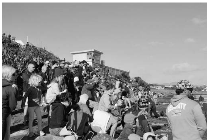
A good crowd of spectators at the TSB Surf Festival.