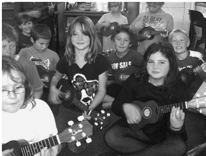
Merrilands students with the new ukeleles.