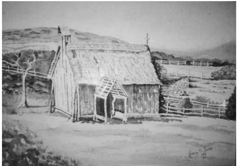
A painting depicting the church as it once was.

The early structure was built at a cost of 50 pounds from personal funds of Bishop Selwyn. The thatched roof is recorded