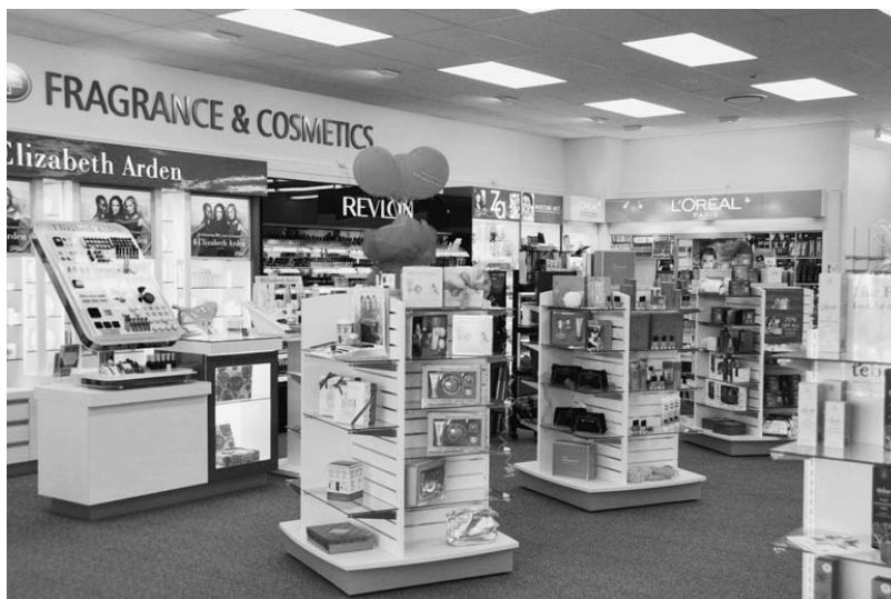
The fresh and tasteful Interior of the new pharmacy.