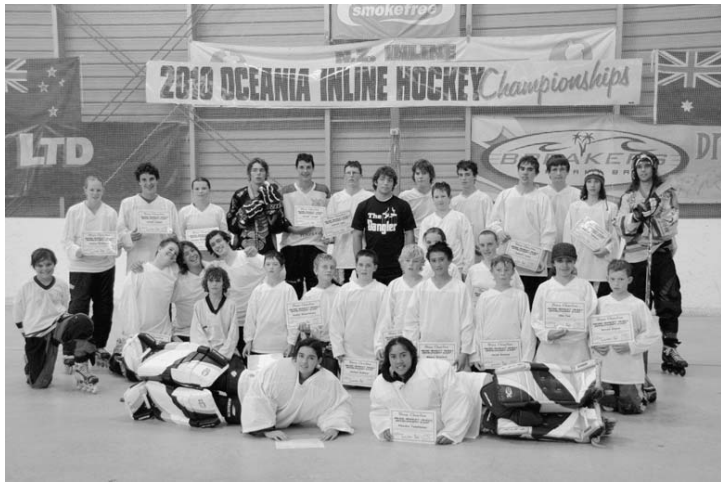
The training camp attendees.

'camp' of 30 plus players down the beach during the lunch break to give them a change from hockey for an hour.