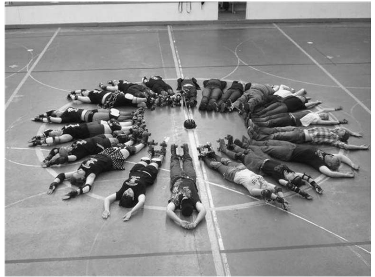
The Show Ponies, aka the NP Roller Derby girls, during filming.