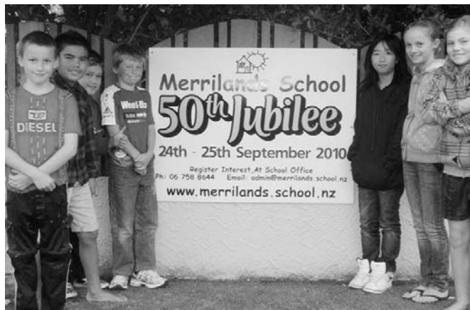
Students gather around one of the 50th Jubilee signs.

Merrilands School is proud of everything we do to support successful learning for all students. We are proud of the way in which our students are inquiring learners well engaged in their learning. We are blessed with probably the most spacious grounds of any New Plymouth primary school, and wonderful playground and classroom facilities. Class sizes are small. Junior classes average 17 students per room, with senior classes averaging 22 students per room. This really enables teachers and support staff to meet the needs of each student. If you are looking for a school for your child Merrilands School is certainly worth a visit.