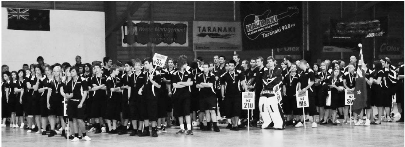
Below: the assembled NZ players.

Arena, one of the best facilities in New Zealand to play inline hockey. Even in Australia, venues offering the facilities like New Plymouth are hard to find.