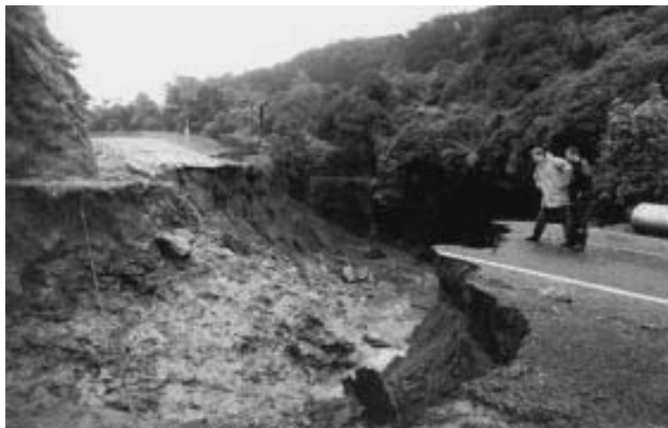
The washout on the Main Road.