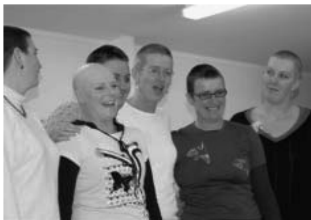
. . . Gone!