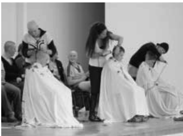
Going . . . going . . .

The big day was upon us - Friday the 31st August 2007. Everyone who so bravely said they would bare their skulls were lined up on stage in the Coastal Taranaki