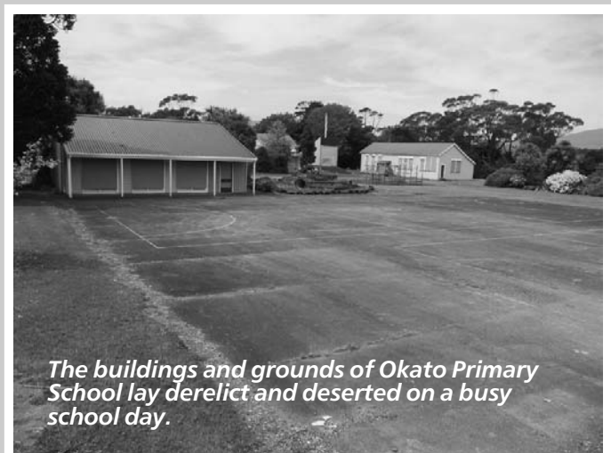
The buildings and grounds of Okato Primary School lay derelict and deserted on a busy school day.