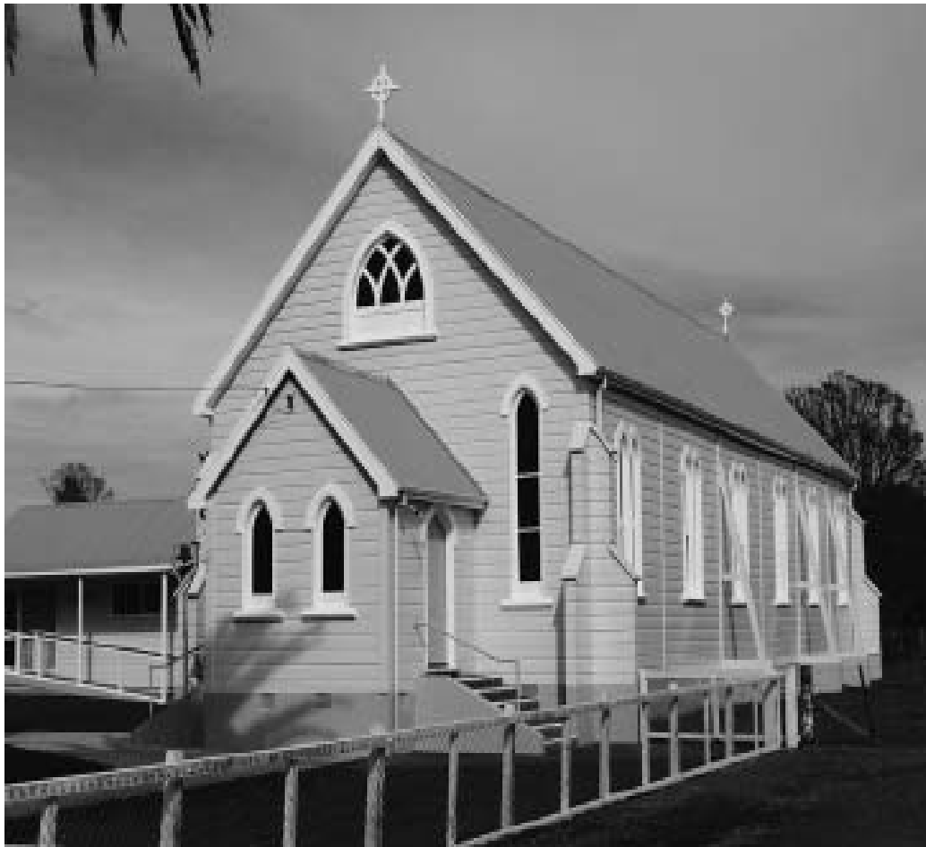
St Patrick's - looking extremely good after a new make over.