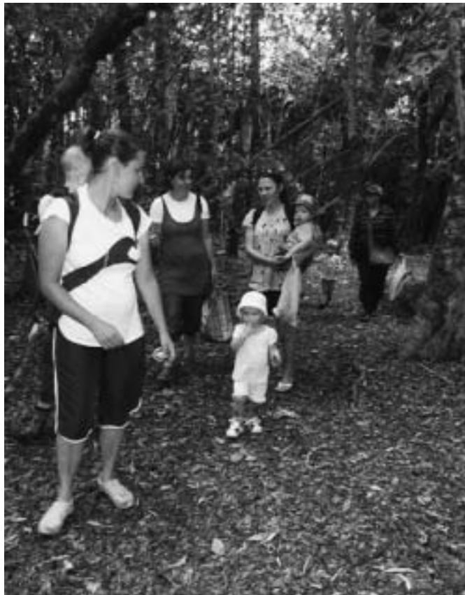
Mums and kids do a bush walk to Okato Pools.

This term we have chosen a goal from the 'Belonging — Mana Whenua' strand of Te Whaariki. This goal focuses on affirming and extending links with family and the wider world, promoting a sense of belonging for children and their families. Here is a taste of some of the activities we have lined up: visits to the Coastal Taranaki School new