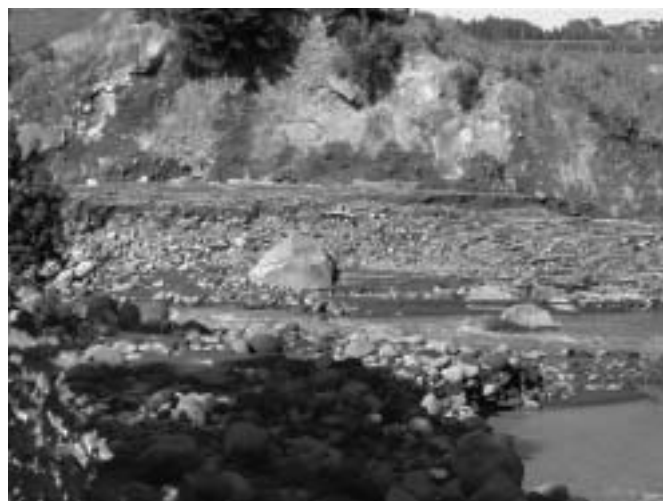
Devastation at the Stony River.