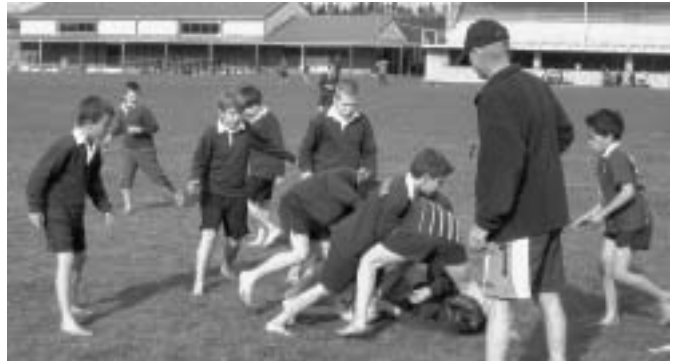
Year 5-6 sports exchange with Tikorangi School.