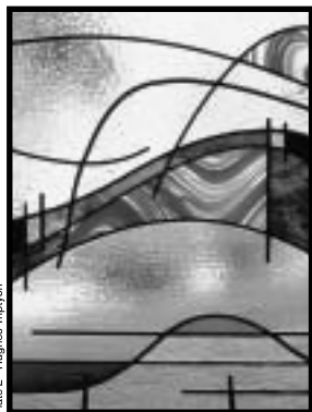
Plate 2 - Hughes Triptych