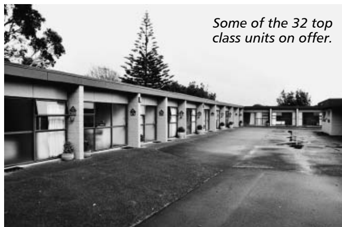
Some of the 32 top class units on offer.