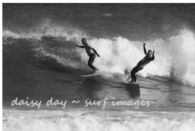
Two Masters compete for the sweet spot at Rocky Rights.