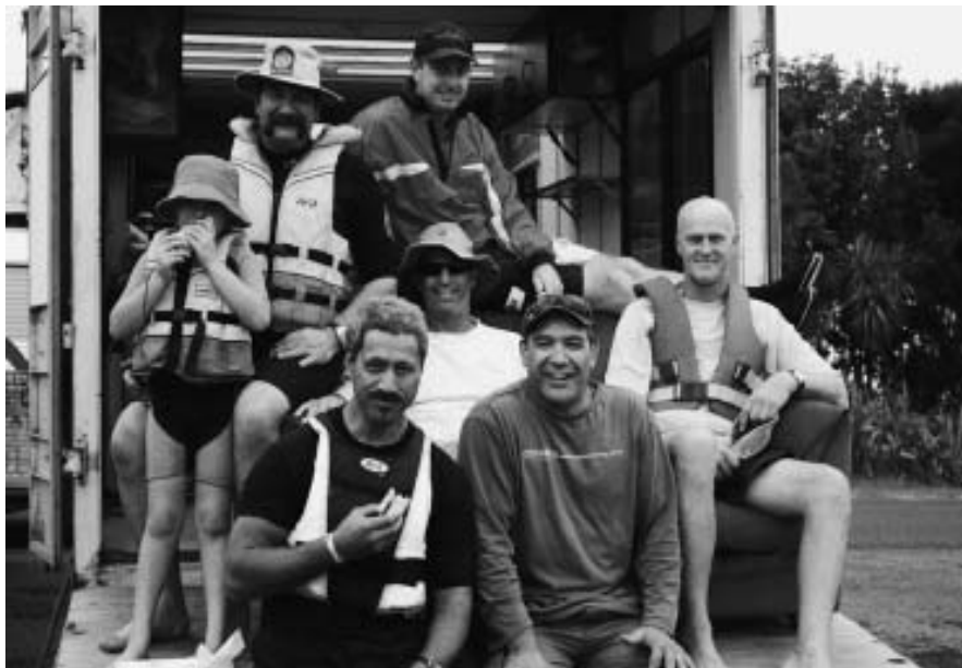
No Dean Barker look alikes in this bunch!