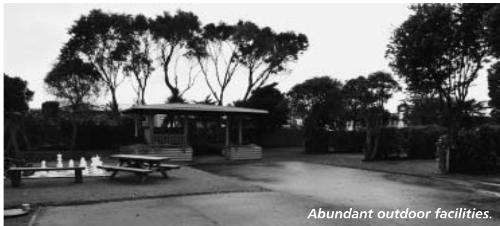
Abundant outdoor facilities.

The New Plymouth TOP 10 Holiday Park offers visitors a unique experience – the quietness of a rural setting with established trees, hedges and gardens providing a lush green space, yet within walk-