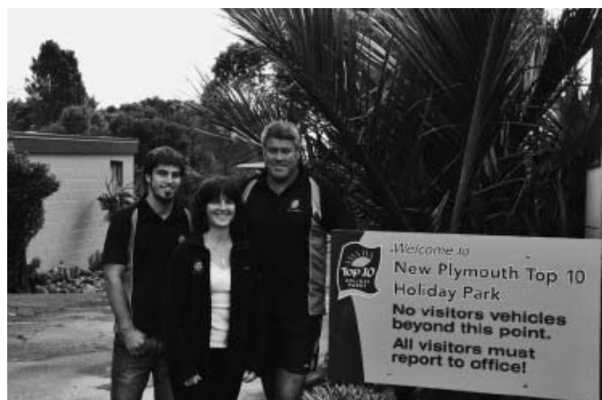
Always a warm welcome from the Hickford family.