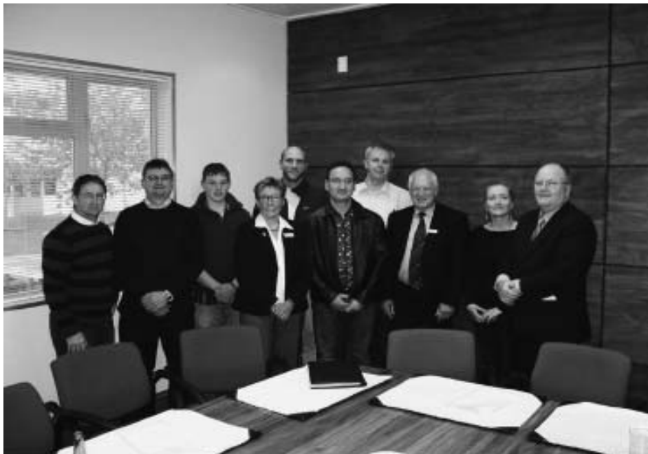
The Board of Trustees with the ERO staff.

"Achieving exceptional results from exceptional effort"