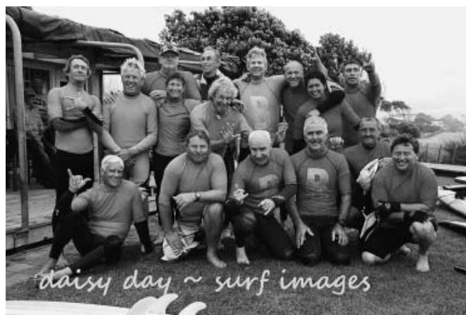
The Rest (blue) and New Plymouth (red) tag teams.

on the beach at 6am on Tuesday morning as volunteers assisting with the TSB Bank Women's Festival of Surfing. Besides helping in many activities, members enthusiastically took part in the Halberg Trust sponsored "Ride a Wave Day" for disabled persons. Held at Fitzroy on Saturday at 1pm, the event was a huge success, with conditions being almost perfect.