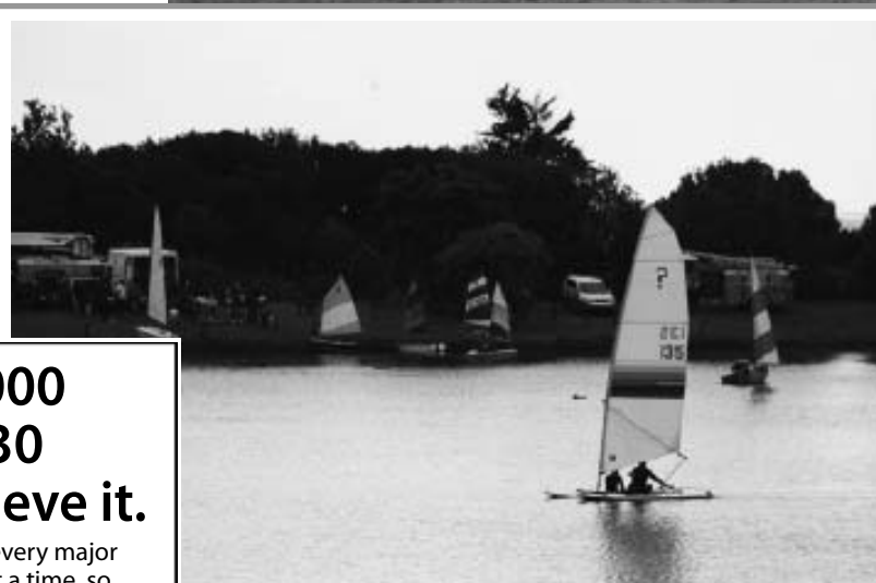
Improved catamaran made from two wind surfers.