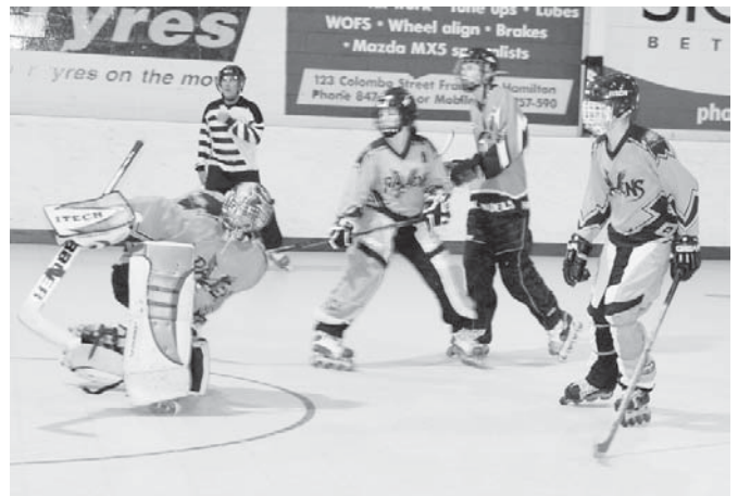
The 16/1's in their first Central League game against the Hamilton Devils.