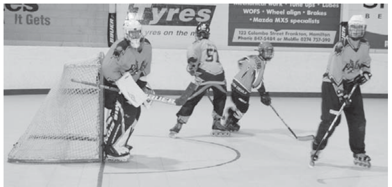
The 16/2's against Hamilton Devils.