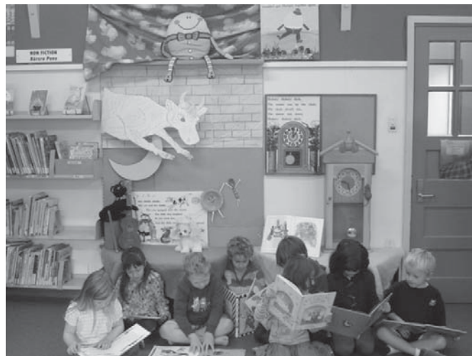
Lots of fun for the students in the library.

Have we future Para Olympians at Fitzroy School?