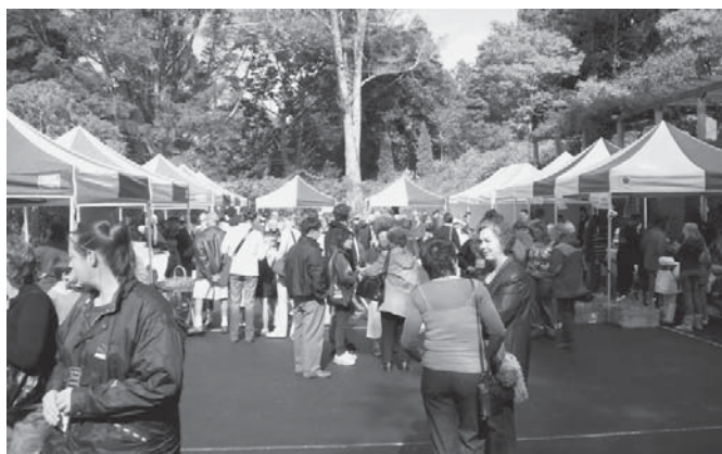
The farmers market in full swing at Tupare.