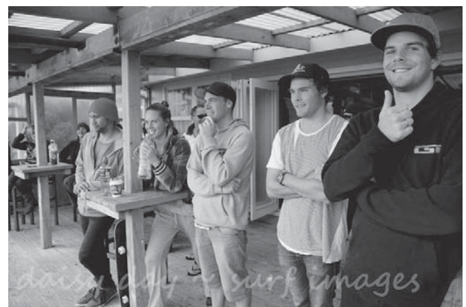
Taranaki Christian Surfers Inter-club champs 2011.