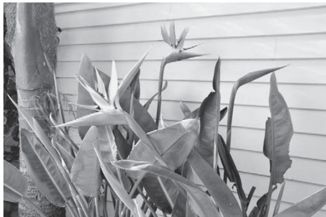
Above, a colourful burst of colour in the winter – Bird of Paradise.