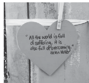
Helen Keller summed it up.