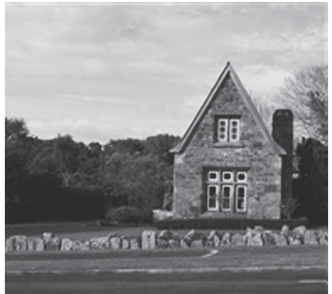
Te Henui Vicarage.