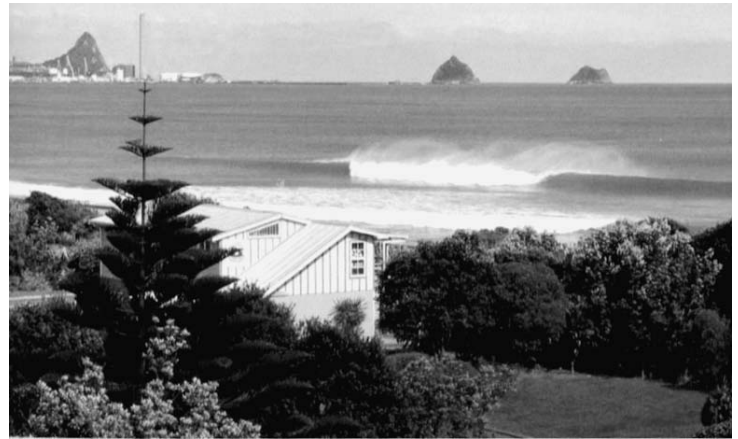
Fitzroy Beach and New Plymouth Surfriders Clubhouse.

PH 06-758-0212 | Email: anita@schoolofswimming.co.nz | www.schoolofswimming.co.nz