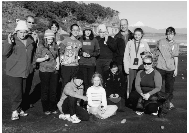
The penguin squad on a footprint search.

The survey only involved people that had a dog in the household, but the findings were of interest to the whole