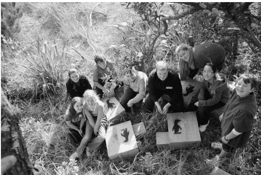
Penguin boxes being moved by the 60 Springs group.