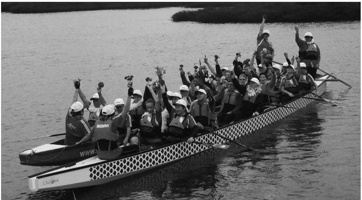
The flower ceremony out on Waitara River.