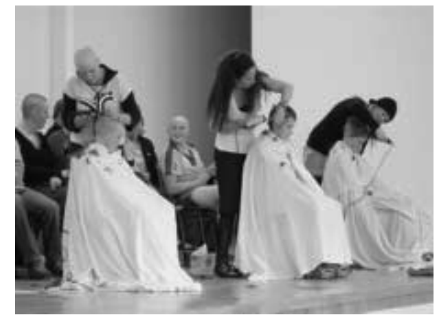
Going . . . going . . .

The big day was upon us - Friday the 31st August 2007. Everyone who so bravely said they would bare their skulls were lined up on stage in the Coastal Taranaki