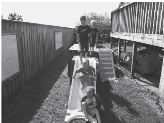
The boys enjoying the warm autumn days.

describe the night is lots of unknown fun!!! Our team of wonderful cooks will be preparing a mouthwatering three-course meal, but it's up to you what you eat and the order you eat it in! On arrival you will be given a menu in cryptic verse. What you eat depends on what you think!! It's a great way to have a night out with your staff or maybe a way to get the people in your street or the local farmers together. A cash bar will also be available. All this is happening for a cost of $25 on Saturday, 23 June 2012 at the Hempton Hall, Okato. Doors open at 6pm and the meal will begin at 7.30pm. To purchase tickets, or if you have any other enquiries please contact myself, Rebecca Ripia, on 06-752 4501 or email okatoplaycentre@gmail.com . So let's get together and help support our children with a safer, more functional Playcentre building for a further 40 years.