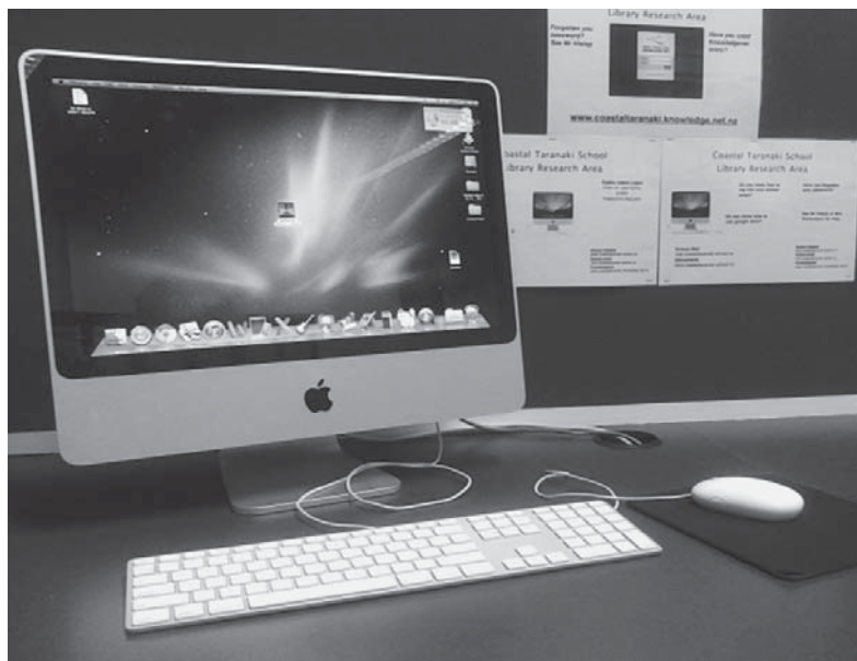
One of the fabulous new Mac computers available for public use.

We are not a branch library of Puke Ariki, you cannot use your New Plymouth Library card here and books borrowed from New Plymouth and Oakura Libraries need to be returned there.