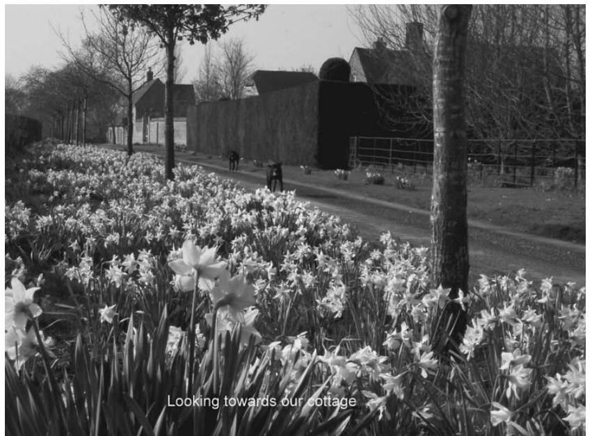
Hugo and Hector running away from our cottage.

We have noticed that there are no verandas over footpaths, that British black taxis are now all sorts of colours, that food is cheap — even milk from NZ, which is selling in a local supermarket for cheaper than it sells in NZ — and that a wide range of produce is always available in the supermarkets.