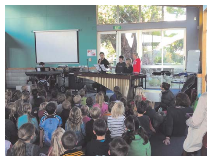
Students learning how to play the marimba.