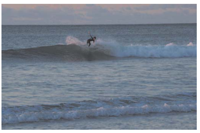
Kalani Watts at Oakura Beach.

The much needed and anticipated new improved Oakura Skate Park is in the planning stages and there is hope it will be completed early in the New Year all going well with a bit more funding secured, this will be a further asset for the community and entertainment for the huge group of kids in the village.