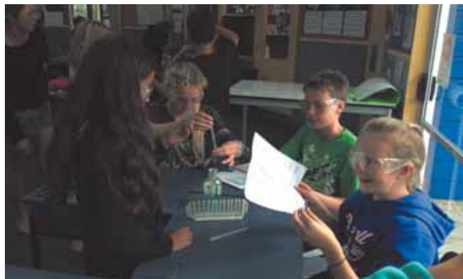
Test tube scientists.

The year 5 and 6's had their very first interschool fixture against Spotswood School on Friday the 8th May. There were two netball games, a soccer game and a rugby game. All teams played very well by playing fairly and competitively.