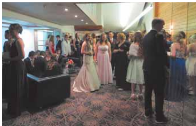
The school ball.

ANZAC Services – I was extremely proud of the way in which our students honoured and commemorated 100 years since Gallipoli. Special thanks to parents, present and past students who contributed to our ANZAC Services and who marched with us on the morning of 25 April.