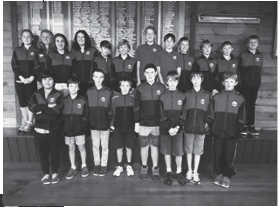
The proud bowlers from Oakura School had an excellent time.

On Thursday 4th July, 20 Oakura School students travelled to Okato to compete in the annual indoor bowls tournament. Each year members from the Oakura Bowling Club work with our year 7 and 8 students to teach them indoor bowls and they select five teams to compete in this tournament.