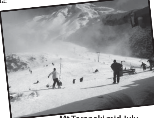
Mt Taranaki mid July.