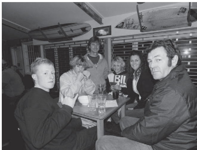
The Groms team at the Surf Quiz Night.