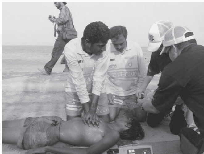
Surf Life Saving Pakistani style.