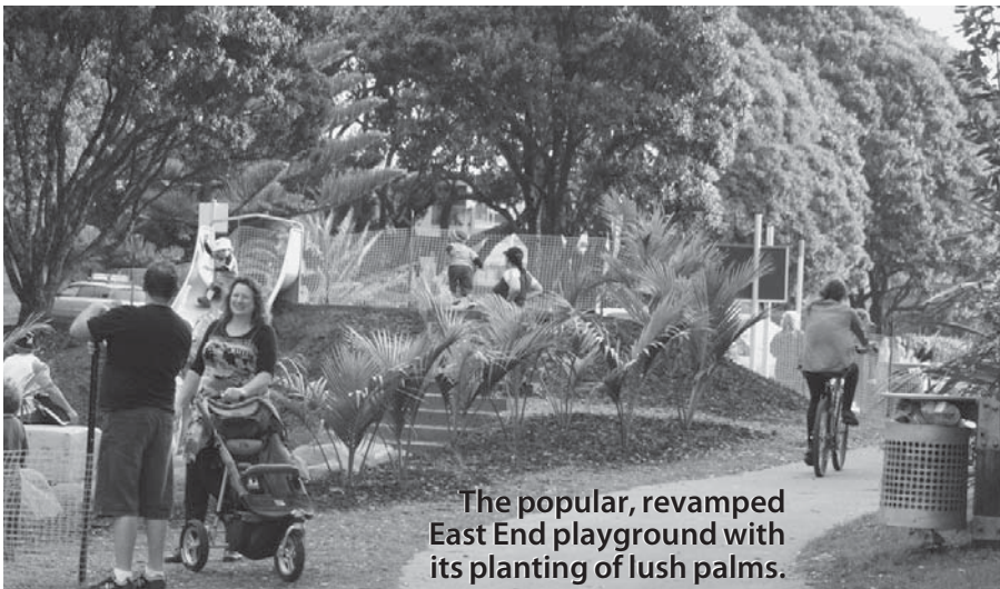
The popular, revamped East End playground with its planting of lush palms.

Gardening didn't seem to be on anyone's mind on the last Sunday of July. The sun was out and so was every man, woman, child and their dog enjoying the weather and the last day of the school holidays. East End was buzzing with people on the walkway, at the beach, skating rink and many enjoying coffee at the Big Wave as well as a huge crowd of families at the newly renovated East End playground. The palms and other plantings are looking great and really complement the playground layout. Speaking with families using the playground, most seemed to think the council had got the mix of playground equipment right, except for a few people missing the old swings.