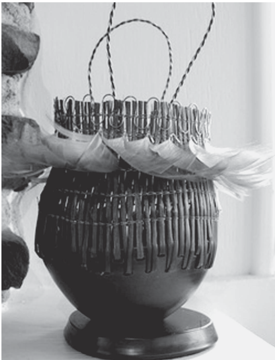
Robyn Lloyd's hand-worked clay pottery.

Over the weekend Robyn held a hands on workshop when she demonstrated her specialised techniques on coiling delicate gourd-like pots. The pots were burnished, dried and then black fired. As aspects of her ceramics style are also evocative of traditional ceramics in other parts of the world, her workshop increased our awareness of different cultures represented within New Zealand's immigrant population