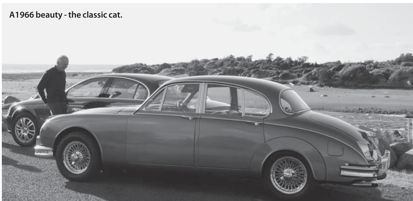
A1966 beauty - the classic cat.