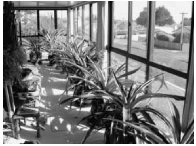
A tropical haven right outside the door.

summer that heat can get up to 35°C and it's in the warmer temperatures that the plants grow a lot faster. It takes 18 months to two years for the fruit to develop. It's a fascinating process and for about two weeks at one stage the fruit has beautiful mauve flowers on each of its spikes. Many of the plants have small 'pups' growing on their sides and these will eventually be able to produce fruit.