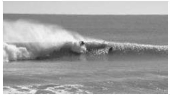
Saturday 25th July.